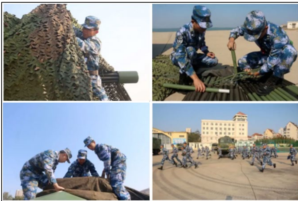
Graphic 1: PLA Navy Reservists conducting training. 4