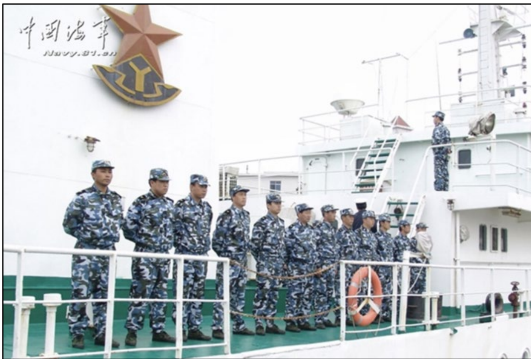
Graphic 2: PLAN Reserve vessel with reservists aboard. Reservists wear the PLAN uniform with a “Y” insignia indicating they are a member of the PLAN Reserve. 12

At present, there are three major reforms affecting the evolution of PLAN Reserve. The first is a commitment to decrease PLAA Reserve and increase PLAN, PLAAF, and PLARF Reserves. The second reform is to optimize the PLA Reserve organizational structure to adapt to future combat needs and integrate with the active-duty component. 10 The third reform, codified in the 2023 Reservist Law, widens the net of eligibility to include, notably, non-prior service individuals with special technical or professional skills from the civilian sector. 11 These reforms are being implemented through a series of changes in military legislation and new policies governing the PLA Reserve specifically.