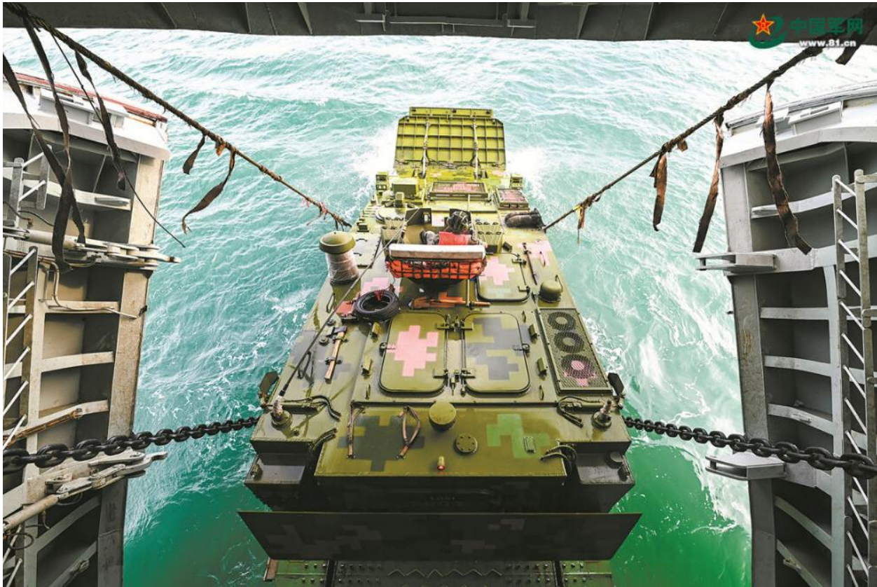
Exhibit 3. An armored vehicle operated by an Eastern TC amphibious combined arms brigade enters the water from a PLAN landing ship during training (summer 2021). 23

In roughly 20 exercises, no landing ships were observed or mentioned, and amphibious vehicles were observed only swimming to/from shore, sometimes firing at targets on shore. It is possible that sealift was involved in some of these events, but the majority of reported amphibious training portrayed platoons and companies practicing the basics of amphibious movement to shore. These platoons and companies, no doubt, were deployed to amphibious training areas as part of the battalions to which they belong.