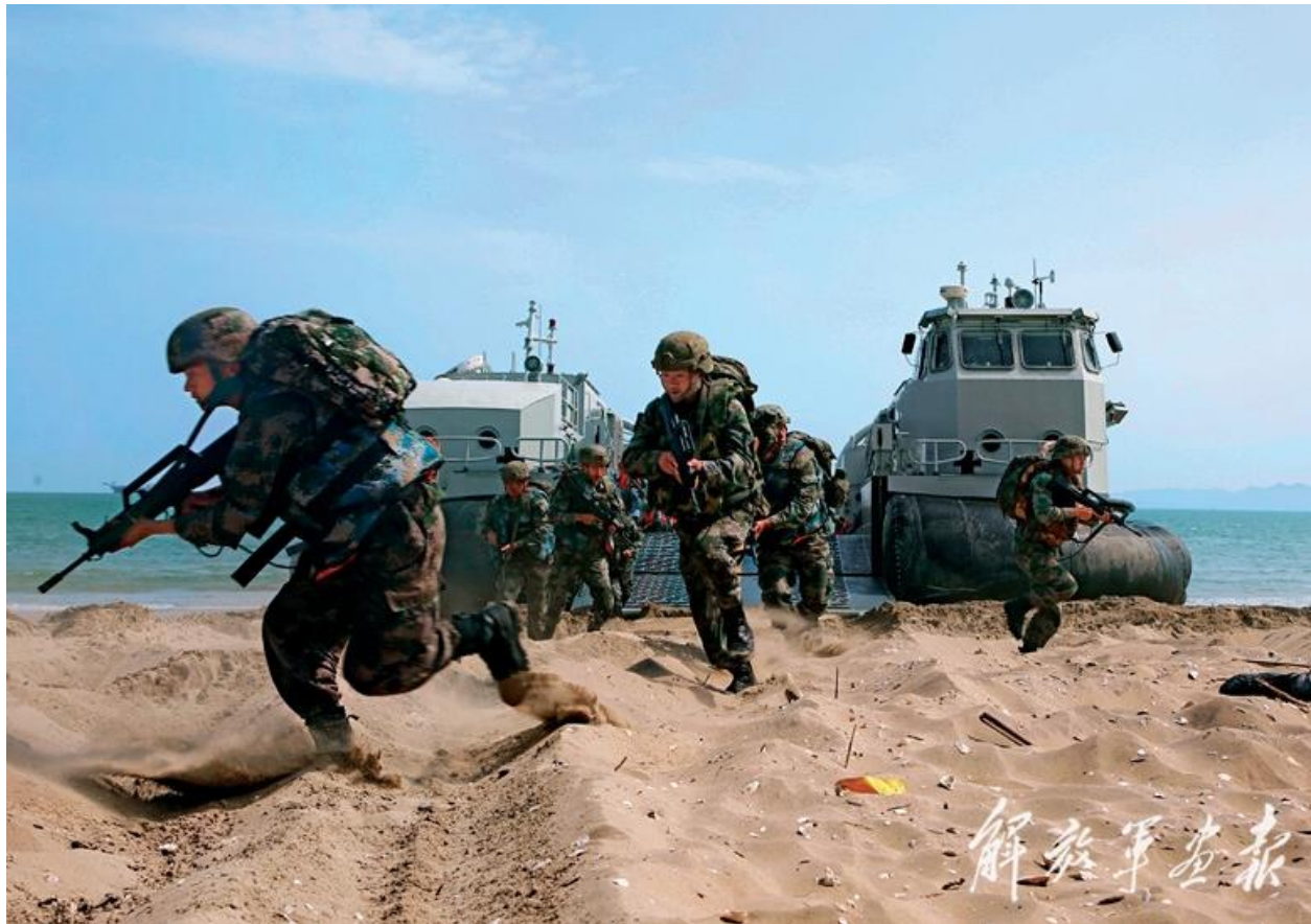
Exhibit 2. Elements of a PLAA amphibious combined arms brigade conduct landing drills with PLAN forces (late 2021). 17

combined arms battalions must be capable of conducting. 16 Many aspects of amphibious training also are more dependent on weather conditions, especially sea states, than other military training, so that most amphibious and sea movement training occurs from around March to September. The limited window of good weather is a factor that may interfere with units completing all required training tasks every year. In addition to dedicated amphibious units, other PLAA units located near the coast (not equipped with amphibious vehicles) also take part in shore-landing or sea movement training.