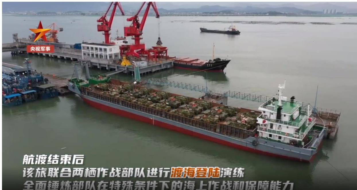
Exhibit 4. Elements of a heavy combined arms brigade of the 72 nd Group Army conduct embarkation and sea movement exercises on mixed shipping at a site near Tiegang Harbor, Zhejiang province. 24

conducted in 2021 indicate an increase or decrease over normal training patterns. It also is not possible using only open sources to determine how many of the PLAA's 24 amphibious combined arms battalions achieved their targets for operational readiness. This analysis does demonstrate that amphibious training routinely is undertaken somewhere along China's coast, weather permitting, nearly every week from March until October.