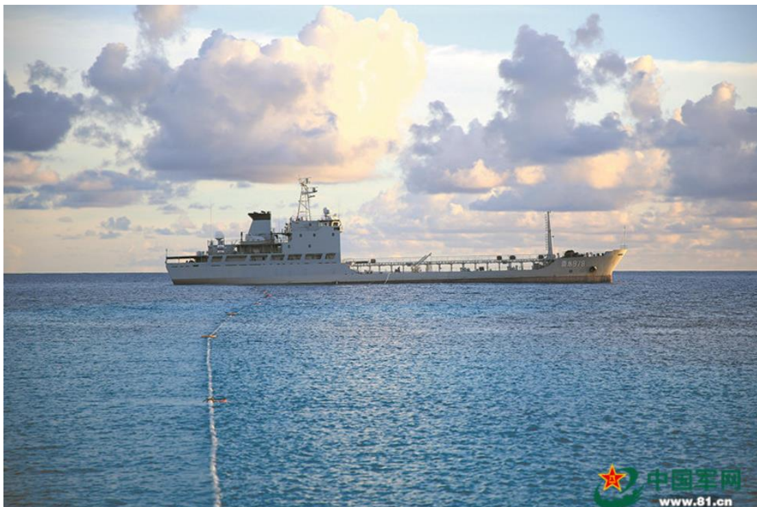
Exhibit 9. A PLAN auxiliary ship conducts off-shore replenishment. 78

POL support for the landing operation will require well-trained specialized forces. However, PLA experts believe there is a gap between the existing specialized POL support force and the requirements of a large-scale landing operation. There are too few personnel for mobile POL support, so specialists would have to be pulled from oil depots, thereby weakening the depots' capabilities. Moreover, there are too few field oil pipeline units to support requirements. Reserve POL support units and local support forces, which might not have adequate training, would need to be mobilized to meet shortfalls. Additionally, POL infrastructure and supply forces are vulnerable, requiring protection. An emergency repair force, alert system, defense, camouflage, and concealment would be required to protect and restore oil support during combat. National mobilization would be required to provide sustained strategic POL support for the operation. 79