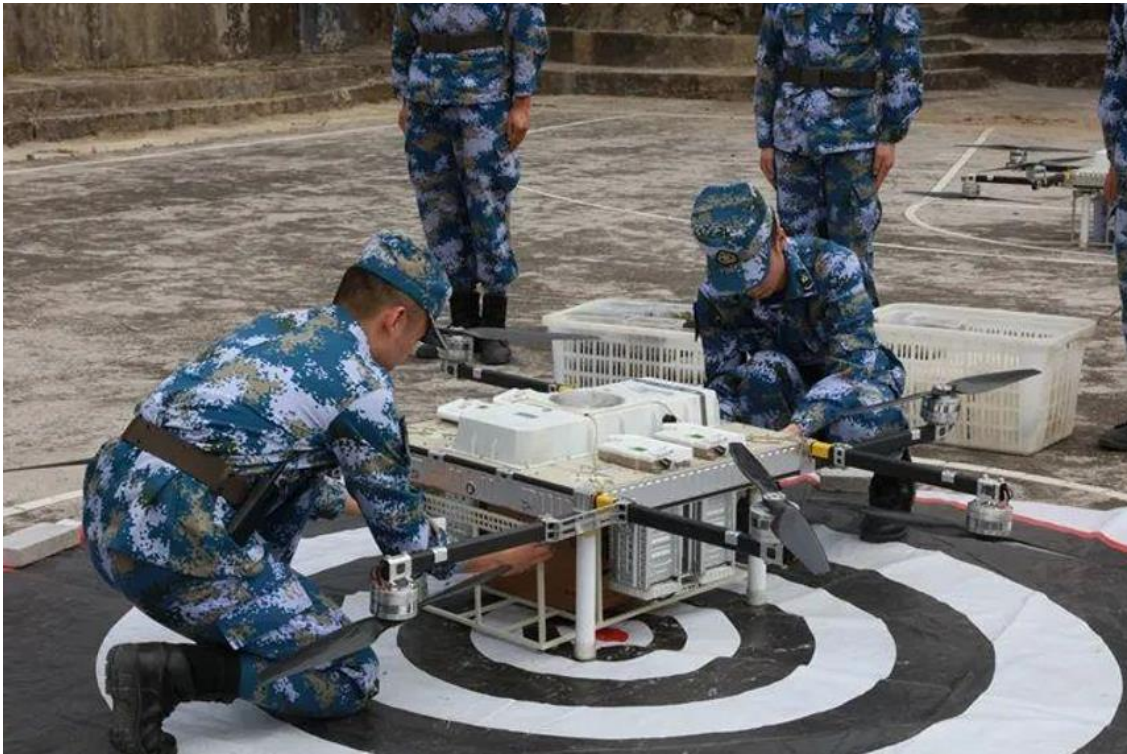
Exhibit 5. PLAN logistics personnel load materiel on a UAV. 37

The PLAAF has studied the U.S. military's use of unmanned vehicles and precision air delivery to provide logistics support in Afghanistan. 35 In 2017, the PLAAF began experimenting with delivering supplies to remote units with unmanned aerial vehicles (UAVs). The PLAAF Logistic Department partnered with the civilian company SF Express to use a medium-size drone to provide supplies by parachute. The PLAAF viewed this experiment as part of the intelligent battlefield revolution. 36 Unmanned vehicles (UV) could provide future emergency logistics to isolated units in Taiwan. As larger capacity UVs are developed and deployed they could become an important method for providing support to the assault landing force.