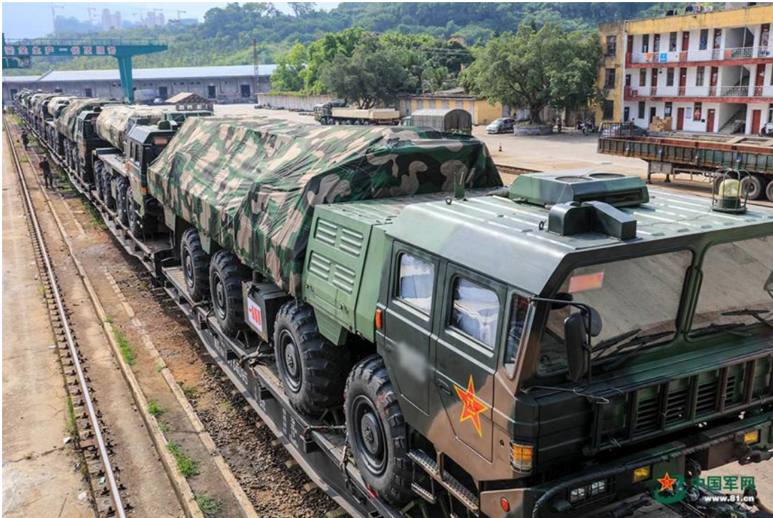
Exhibit 7. Rail movement of PLA equipment. 41

to the southeast coast. The PLA assesses that 40 percent of rail capacity will be used for the operation and in special cases up to 60 percent of rail capacity may be used. 40