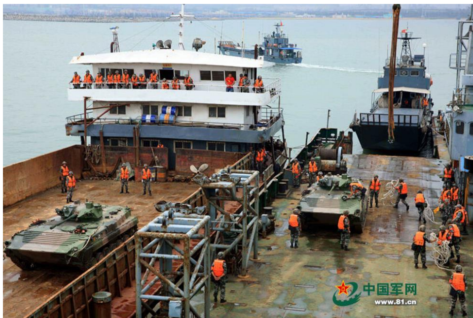
Exhibit 3. The PLA employs civilian ships to transport heavy equipment. 29

The strategic projection support fleet is a component of the national strategic projection support force. It is a reserve component formed from large shipping enterprises—China COSCO Shipping, Hainan Strait Shipping Company, China National Offshore Oil Corporation, and China Shipbuilding Industry Corporation, for example—responsible primarily for force transport and logistics support. They are formed into a three-tier structure, including “general corps” (总队), “groups” (大队), and “squadrons” (中队). The civilian fleet is also required to support offshore and open sea offensive and defensive operations. 28