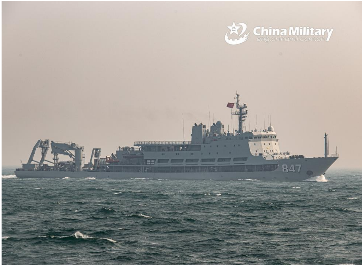
Exhibit 10. The Northern Theater Command Navy comprehensive rescue ship Yangchenghu participates in a joint rescue drill. 85

Campaign medical organizations will reinforce tactical level medical support until field hospitals are established in Taiwan. 84