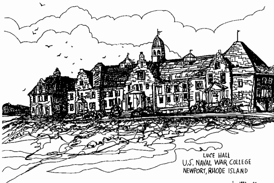
LUCE HALL U.S. NAVAL WAR COLLEGE NEWPORT, RHODE ISLAND